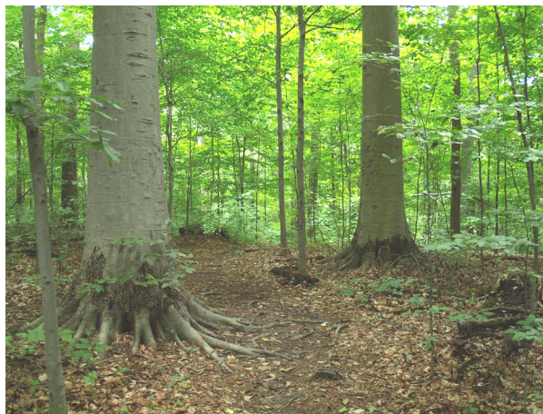
The Nature Center trails are open from dawn to dusk daily.

Visitors Center and Bird Observatory Hours: