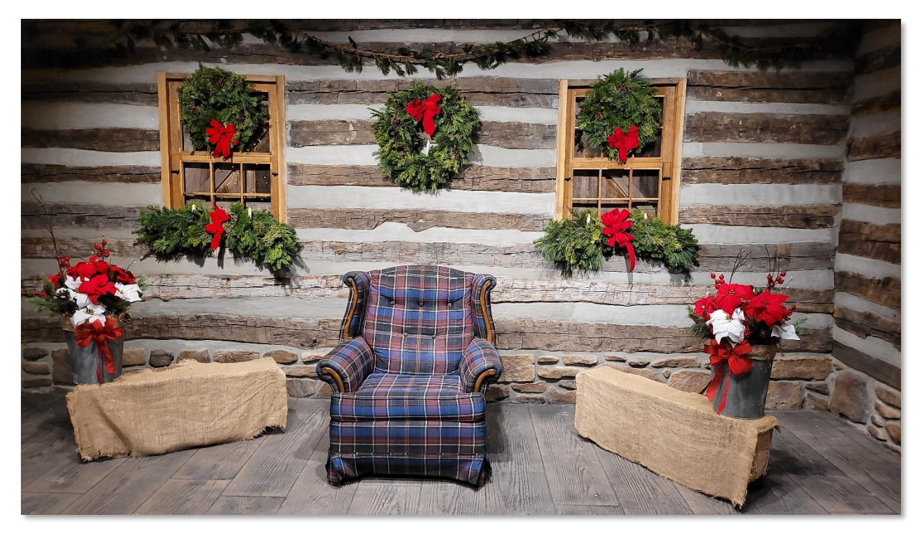
The Huston Cabin decorated in fresh, natural greens for the Holiday Celebration Open House in December 2022. The cabin remains open to visitors for two weeks for a beautiful, rustic location for holiday-themed family photos. The one-day event attracts an average of 100 participants each year.

Community programs and events are promoted through a newsletter published and distributed three times each year to nearly 1,900 postal addresses and over 1,000 email addresses. Additional outlets include UMU Today emails, printed flyers, and social media.