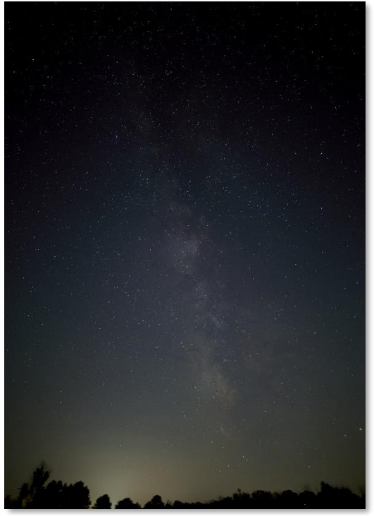
The Milky Way photographed over the Nature Center.