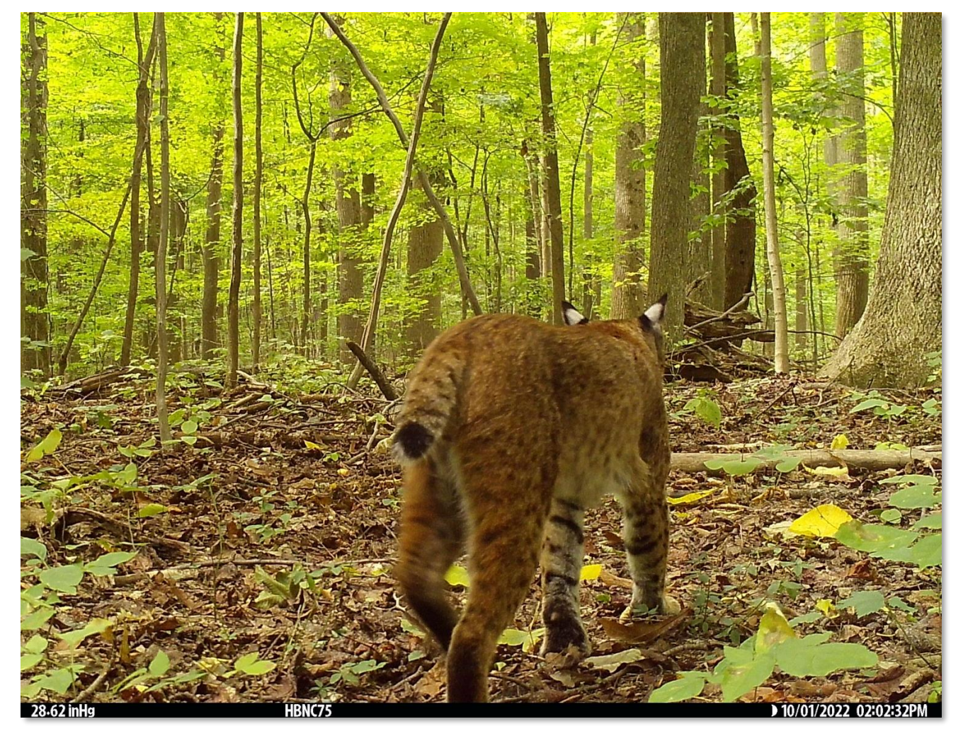
First modern-day documentation of a bobcat at the Nature Center captured on trail camera.

Additionally, the Nature Center staff are involved in academic support of Mount Union's students, supporting teaching activities, conducting and supporting research, volunteer recruitment and retention, facilitating service projects, and the maintenance and improvement of the Nature Center's facilities and grounds.