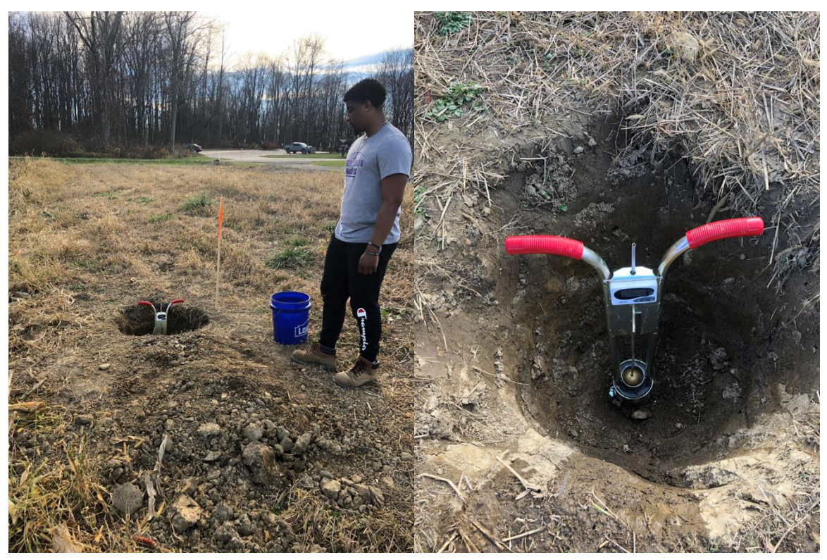
University of Mount Union civil engineering students (ECE 440: Sustainable Infrastructure Design) conduct infiltration tests at the surface and 1-meter depth with an infiltrometer to ensure the permeability of the soil is suitable for the creation of a wetland.

Mount Union students have taken part in several aspects of the site analysis phase of the project since September 2022. Dr. Lin Wu and Dr. Karyn Collie utilized the site for plant surveys with students in BIO 141 (Diversity of Life). After the existing corn crop was harvested, civil engineering students in Dr. Hans Tritico's ECE 440 course (Sustainable Infrastructure Design) completed a thorough topographic survey of the 7-acre site, soil sampling and analysis of soil types in the proposed wetland areas, and infiltration testing of the soil of the proposed wetland areas. Soil analysis and infiltration testing were important to determine the feasibility of the soil to hold water for slow discharge into a nearby stream or the water table below the site, which are critical functions of wetlands. The data collected by Mount Union students during the Fall 2022 semester was used to inform the wetland restoration professionals at M.A.D. Scientist Associates during the initial landscape design phase.