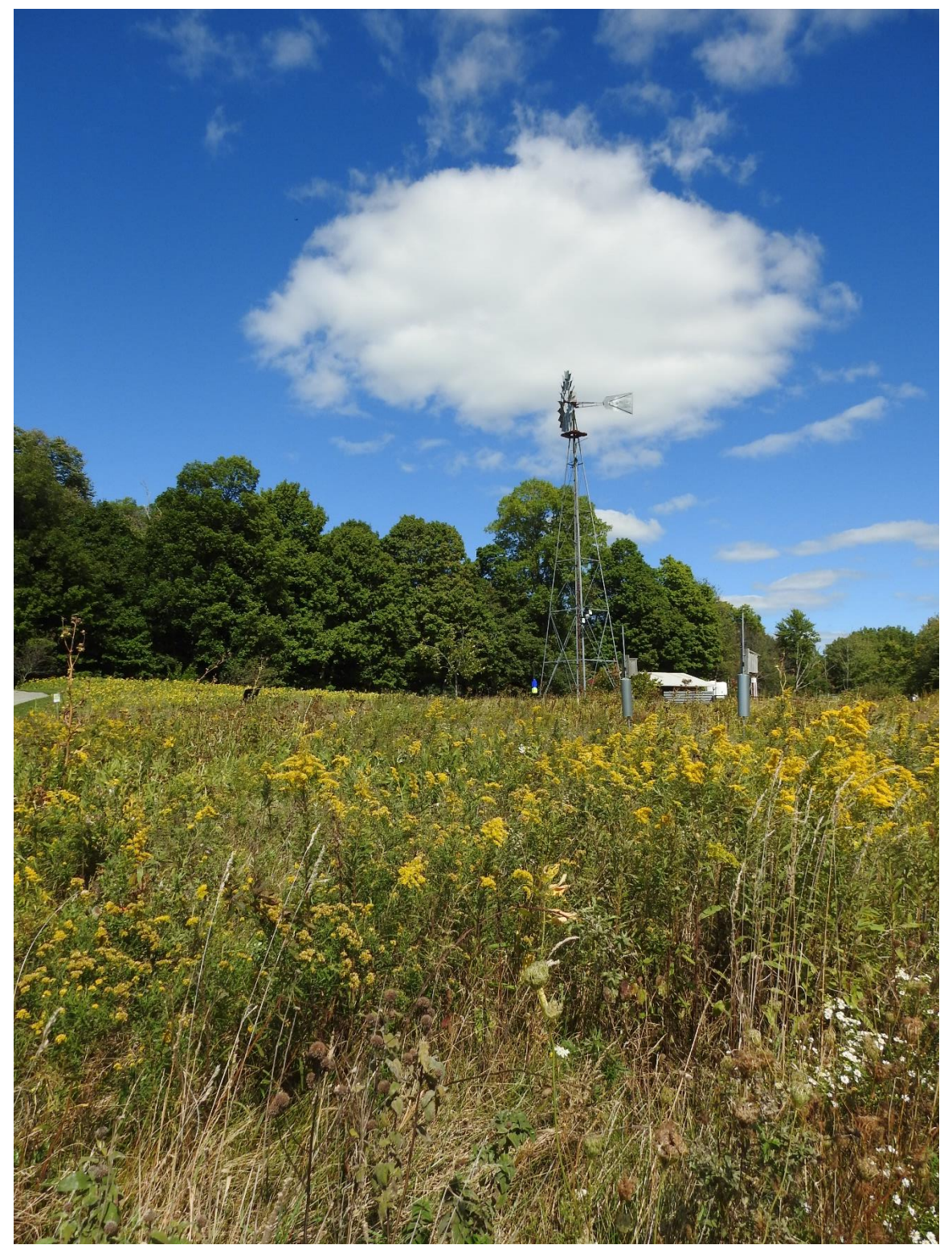
Wildflower meadow and windmill at the North Woods section of the Nature Center.

"First time attending. I really enjoyed myself. The staff was very friendly and answered any questions I had. I was very impressed with the whole nature center. I will definitely return!"