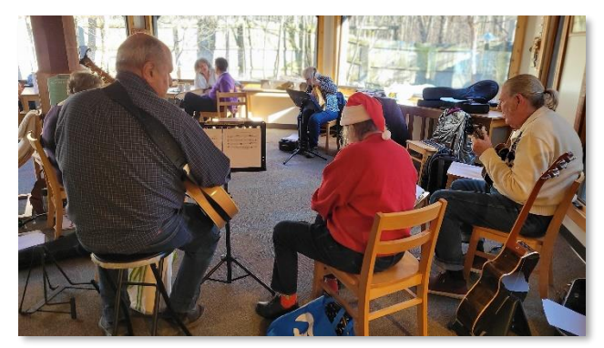
Participants in Acoustic Music Jam play during the annual Holiday Celebration Open House, December 2022.