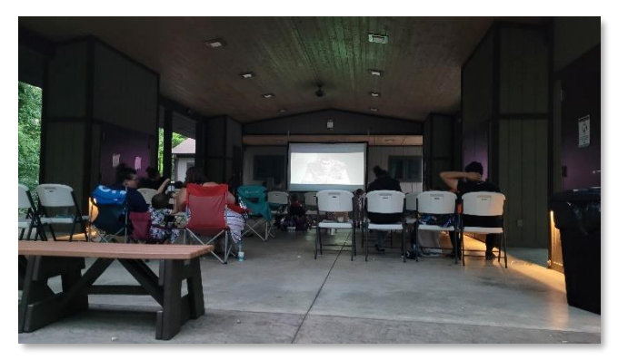
An audience enjoyed an evening presentation of the animated film "The Croods" in the Nature Center's pavilion.

Educational and recreational events facilitated or hosted by the Nature Center included a variety of citizen science events like the Great Backyard Bird Count and bioblitzes, summer research showcase highlighting Mount Union student research, 21<sup>st</sup> annual photography contest, and 6<sup>th</sup> annual holiday celebration open house. A movie night in the pavilion and two canoe trips to local reservoirs were also facilitated.