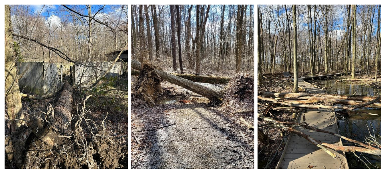
An assortment of trail and property damage after several strong storms during the spring season of 2022.

Structural damage to the boardwalk occurred on four separate occasions, each resulting in a couple days of trail closures to repair the underlying supports of the boardwalk. This type of repair often requires the need for new lumber and hardware and quickly becomes a multi-day project to restore the boardwalk to its original condition.