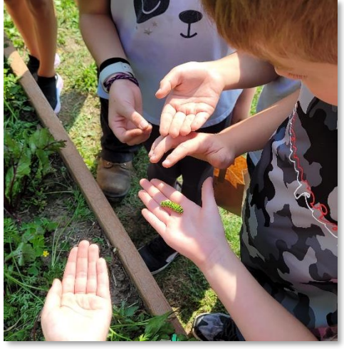
Students found a caterpillar in the Children's Garden at the Nature Center.

Other schools participating in requested programs included multiple disabilities classes from Minerva Middle School and Glen Oak High School and the environmental science class from Salem High School.