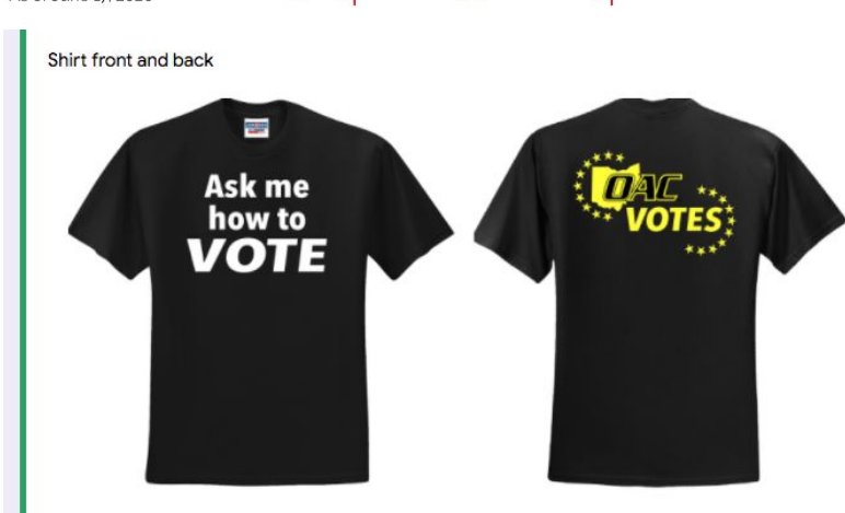
OAC Votes overview and tshirts used on campus